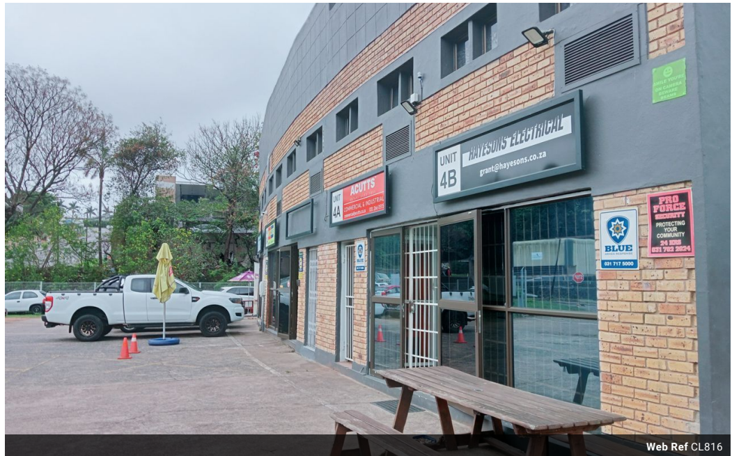
Web Ref CL816