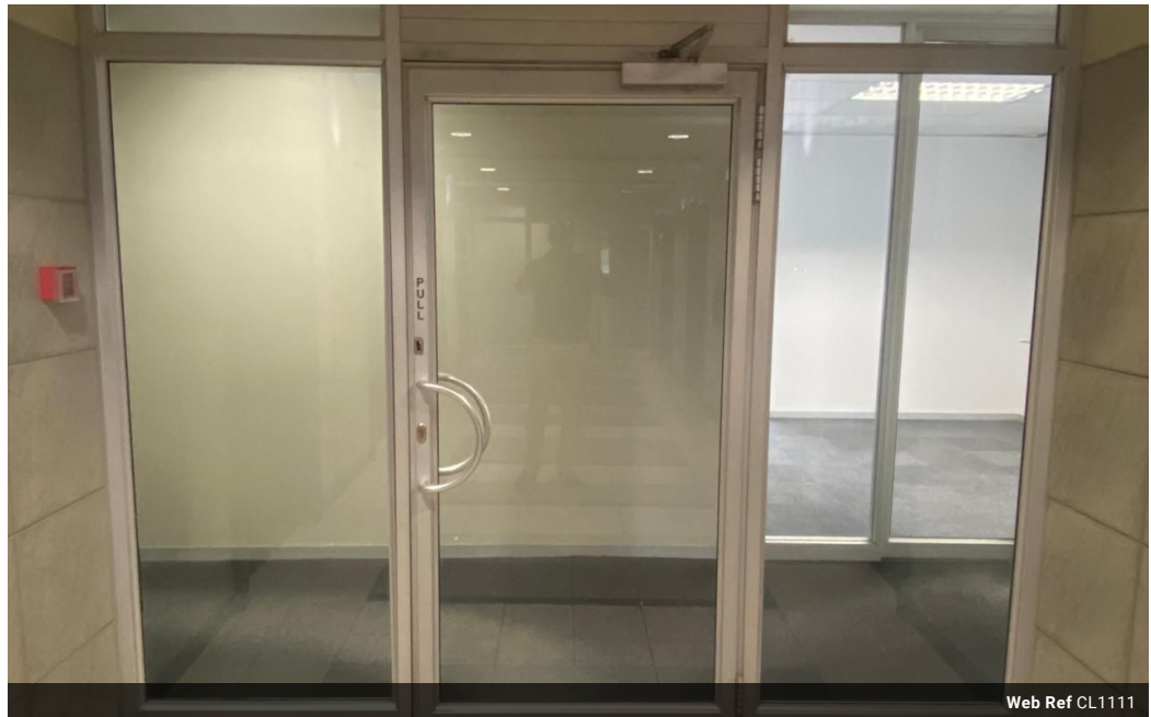
Web Ref CL1111