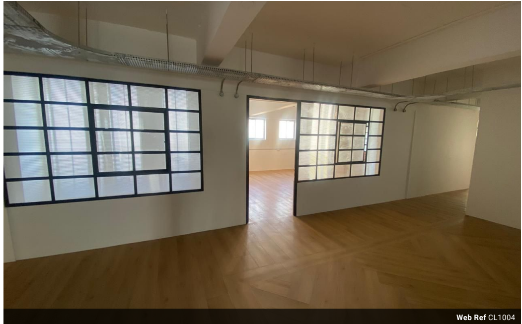
Web Ref CL1004