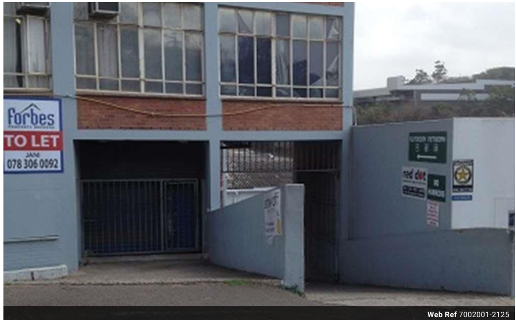
Web Ref 7002001-2125