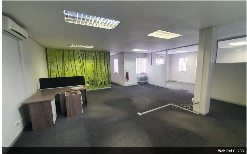
Web Ref CL233