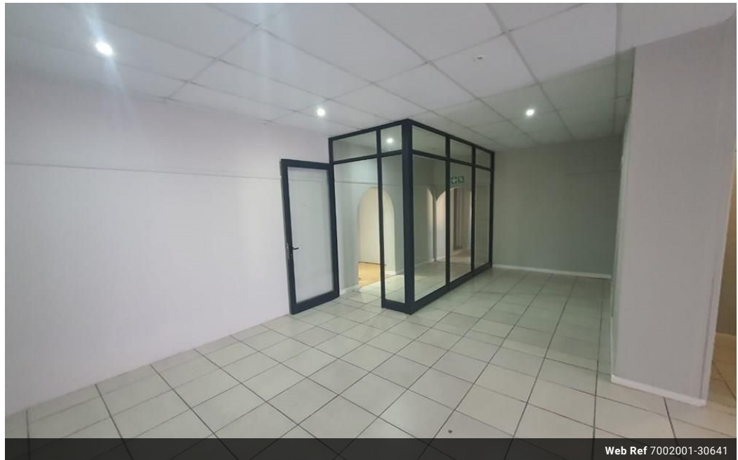
Web Ref 7002001-30641