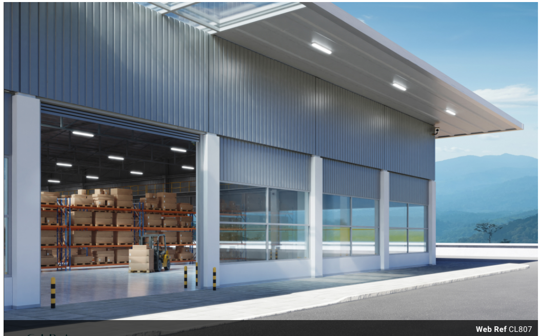
Web Ref CL807