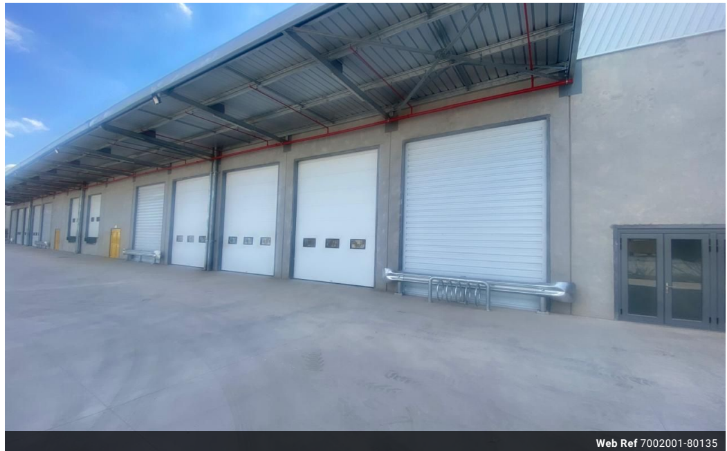
Web Ref 7002001-80135