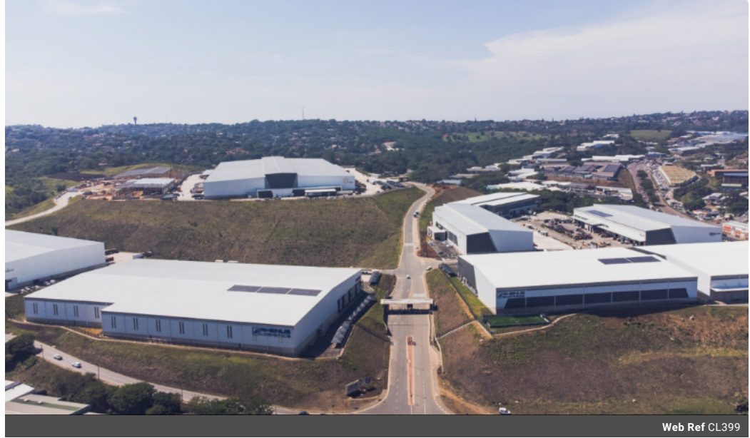
Web Ref CL399