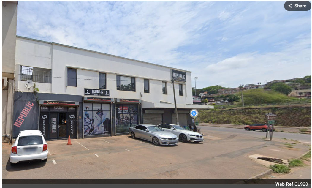
Web Ref CL920