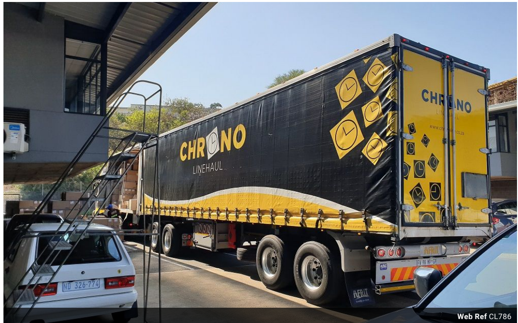
Web Ref CL786