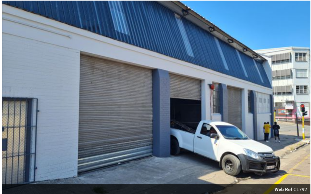
Web Ref CL792