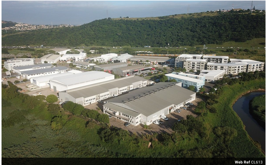
Web Ref CL613