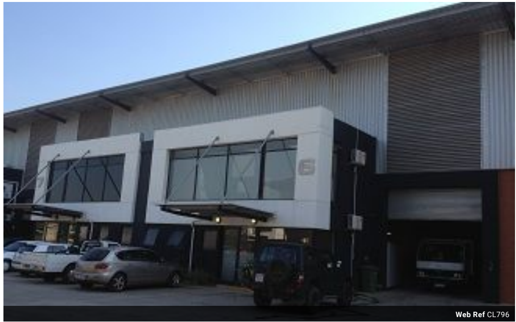
Web Ref CL796