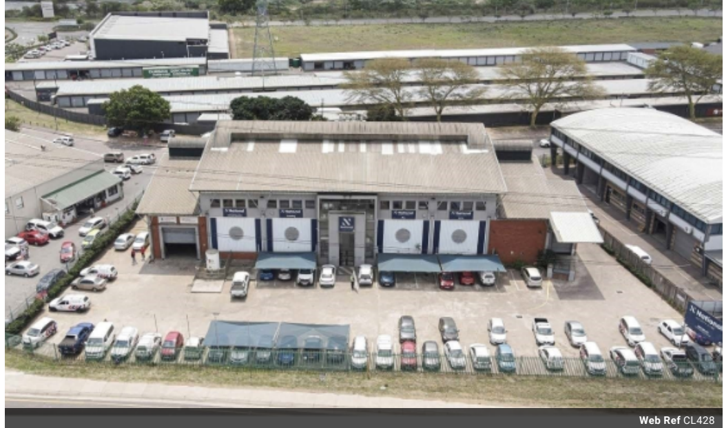
Web Ref CL428