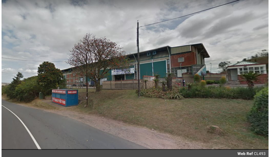
Web Ref CL493