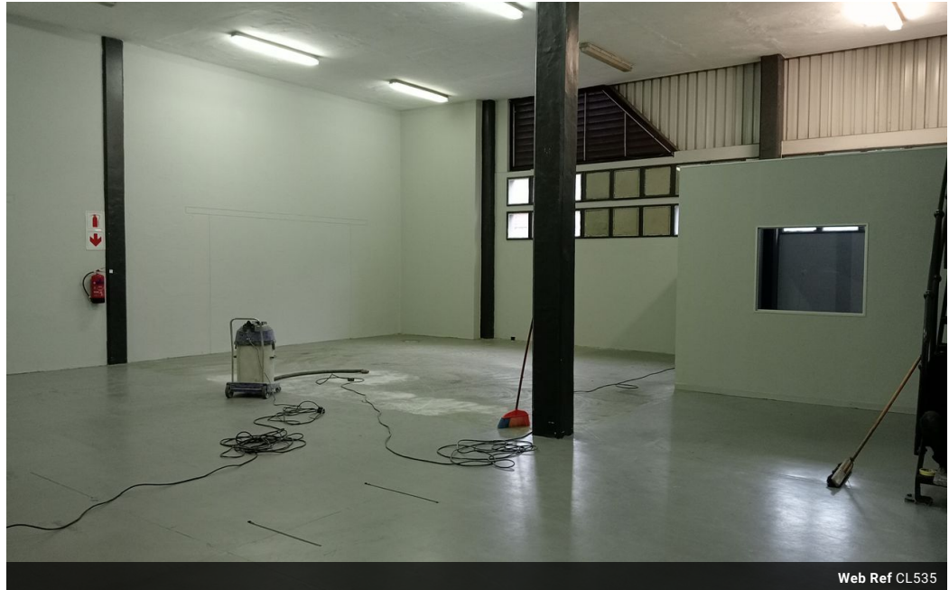
Web Ref CL535