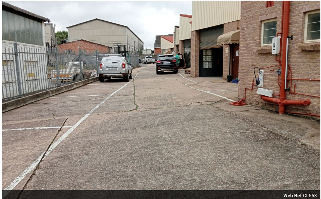
Web Ref CL563