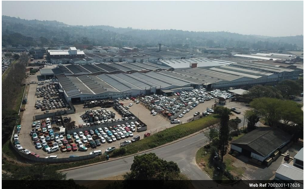
Web Ref 7002001-17626