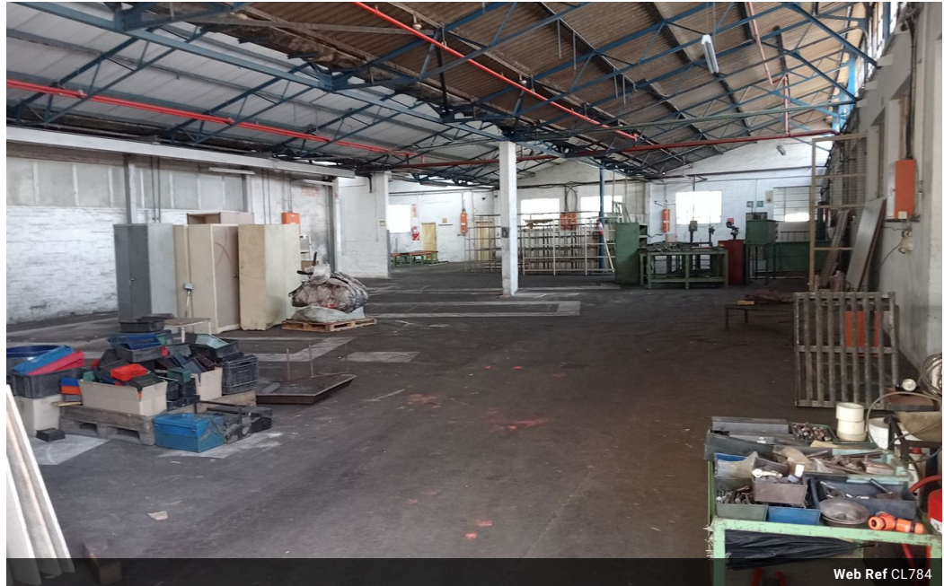
Web Ref CL784