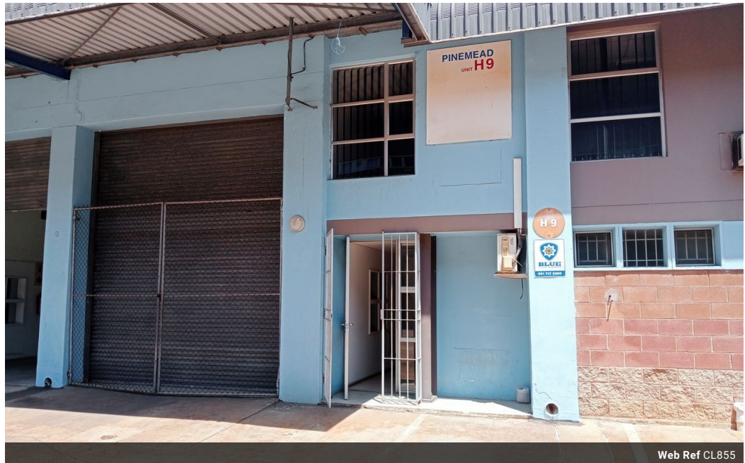
Web Ref CL855