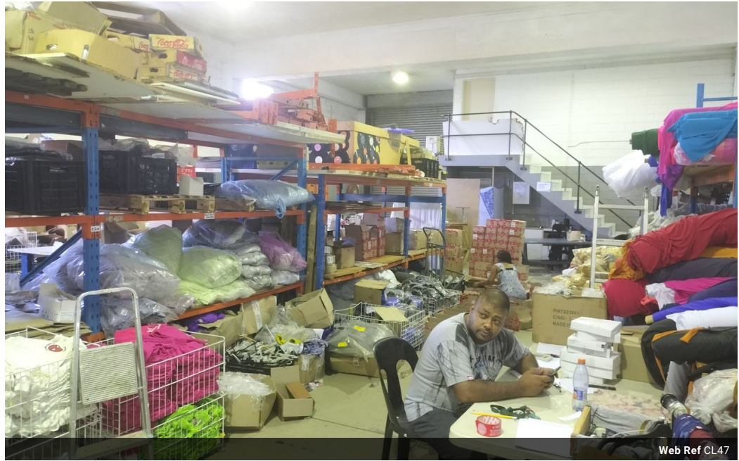
Web Ref CL47