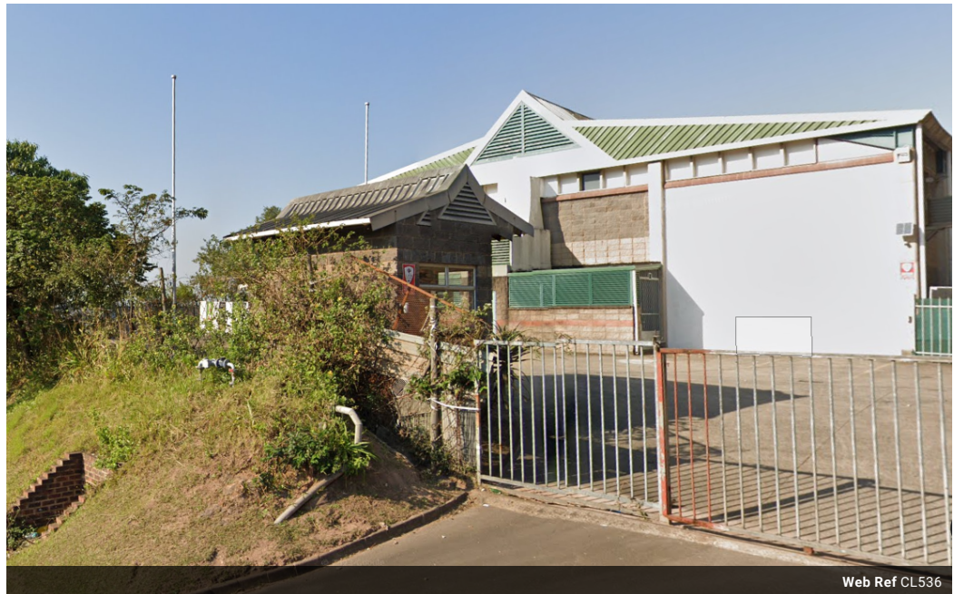
Web Ref CL536