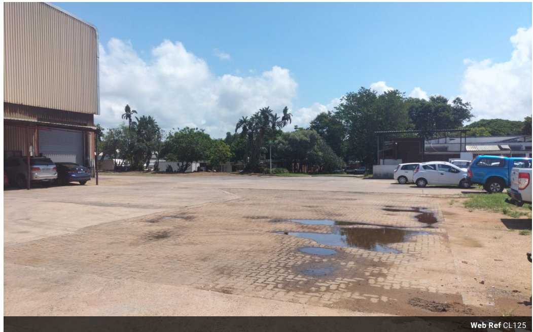
Web Ref CL125