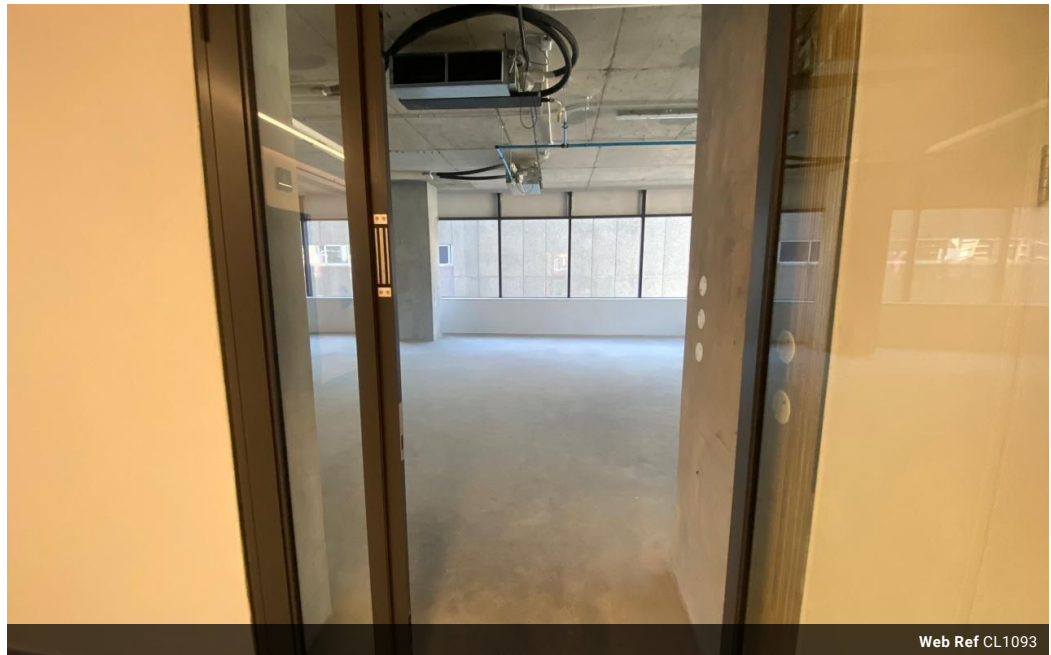
Web Ref CL1093